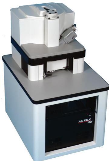
PSEM 3025 Platform